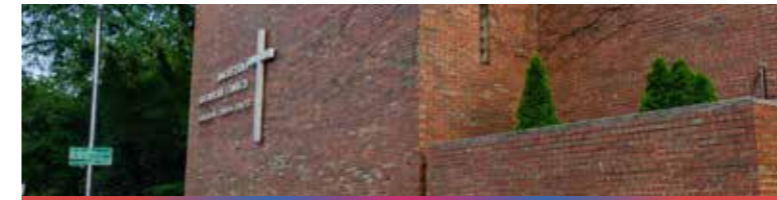
AUGUSTANA LUTHERAN CHURCH 5500 S. WOODLAWN