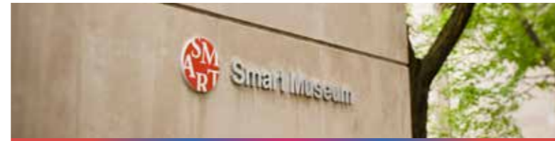
SMART MUSEUM / 5550 S. GREENWOOD