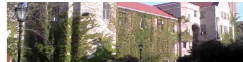
INSTITUTE FOR THE STUDY OF ANCIENT CULTURES (ISAC) / 1155 E. 58TH ST.