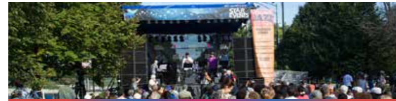
WAGNER STAGE MIDWAY PLAISANCE / S. WOODLAWN

Click on the venues for more information!