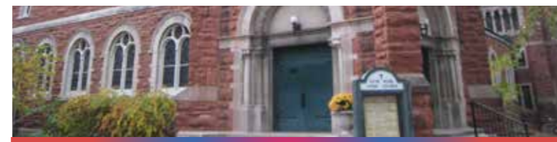
HYDE PARK UNION CHURCH 5600 S. WOODLAWN