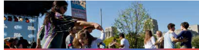
WEST STAGE MIDWAY PLAISANCE / S. WOODLAWN