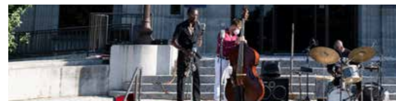
DUSABLE MUSEUM / 740 E. 56TH PL.