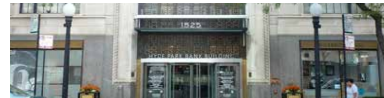
HYDE PARK BANK / 1525 E. 53RD ST.