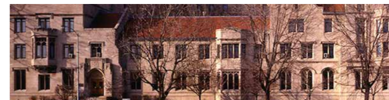
INTERNATIONAL HOUSE 1414 E. 59TH ST.