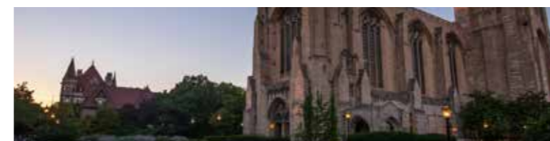
ROCKEFELLER CHAPEL 5850 S. WOODLAWN