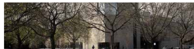
REVA & LOGAN CENTER FOR THE ARTS 915 E. 60TH ST.